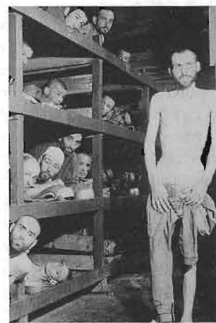
Man's inhumanity to man was on full display in concentration camps like Buchenwald.